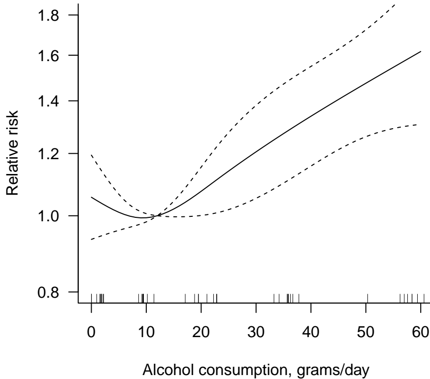
Figure 2: Pooled dose-response association between alcohol consumption and colorectal cancer risk (solid line). Alcohol consumption was modeled with restricted cubic splines in a multivariate random-effects dose-response model. Dash lines represent the 95% confidence intervals for the spline model. The dotted line represents the linear trend. Tick marks below the curve represent the positions of the study-specific relative risks. The value of 12 grams/day served as referent. The relative risks are plotted on the log scale.

popular and published in the medical literature using commercial statistical software, no procedures were available for the free software programming language of R. Therefore, another strength of this paper is to present the first release of the dosresmeta package written for R. In conclusion, this paper described the main steps involved in a dose-response meta-analysis. The dosresmeta package as well as worked examples can be useful to introduce researchers to the application of this increasingly popular method.